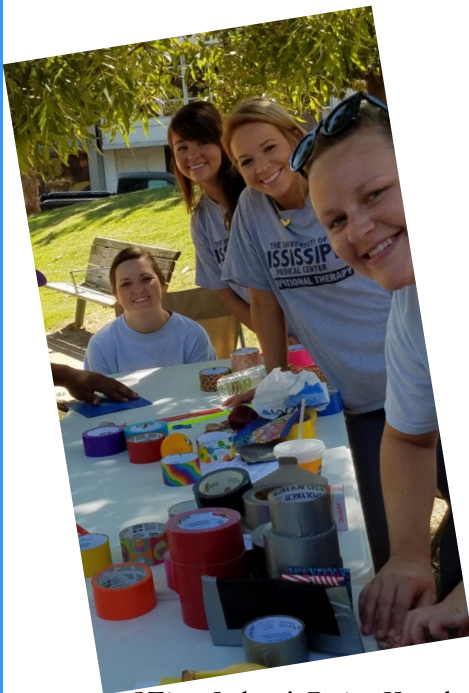
OT3s at Jackson's Project Homeless Connect—helping participants make duct tape wallets.