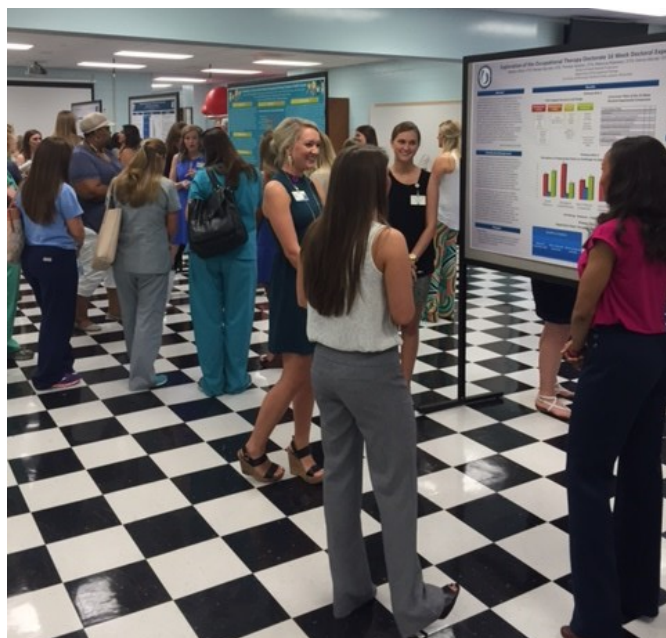
April 2016 MSOTA Central District Meeting with UMMC Class of 2016 presenting research poster presentations.

SEE PAGE 4 & 5 of this newsletter for more information on the MSOTA Race!