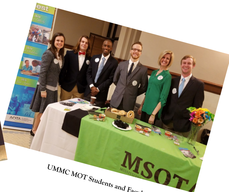
UMMC MOT Students and Faculty