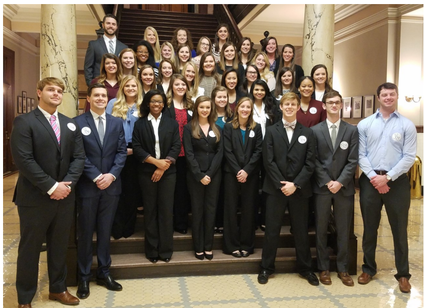
UMMC Students at MSOTA Legislative Day