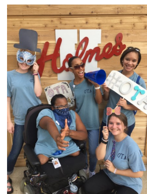
HCC OTA Students Fall Fest Activities - Increasing awareness of Occupational Therapy to the faculty and students on the Ridgeland campus.