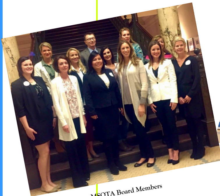
MSOTA Board Members