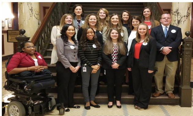
HCC students participated in MSOTA's Legislative Day

The HCC OTA program is enjoying the momentum of the spring semester! We currently have 14 students in Level II field-work. These students are flourishing under the guidance of our wonderful clinical instructors! The first year students are busy in the classroom and community. They are actively engaged in MSOTA activities including their recent participation in Legislative Day and upcoming preparations for the MSOTA 5K held on the HCC Ridgeland Campus. The HCC OTA faculty are proud of our students continued success and the gains made in increasing awareness of our wonderful profession.